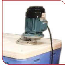
Motor with Gear Box